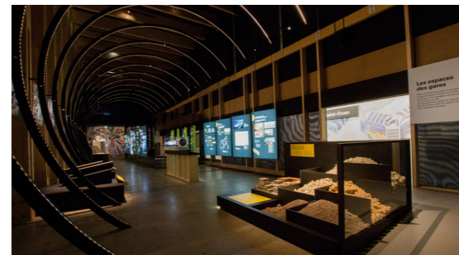
Fabrique du Grand Paris