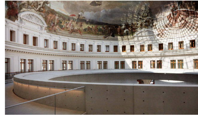
Pinault Collection

The students of the Summer Seminar will also visit important monuments and places of Parisian history, such as the Carnavalet Museum (museum of the City of Paris), or the Pavillon de l'Arsenal (place dedicated to the presentation of the projects of town planning in Paris). Conferences and visits will also be dedicated to the construction sites of the Greater Paris metropolis, such as the Fabrique du Grand Paris, presenting the new metropolitan network or projects for the 2024 Olympic Games.