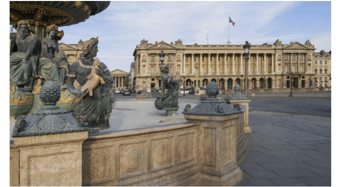
Hôtel de la Marine