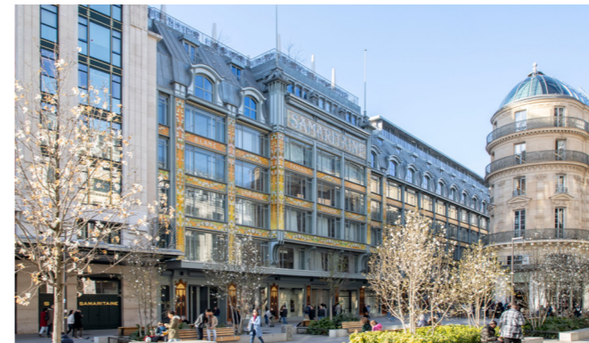
La Samaritaine