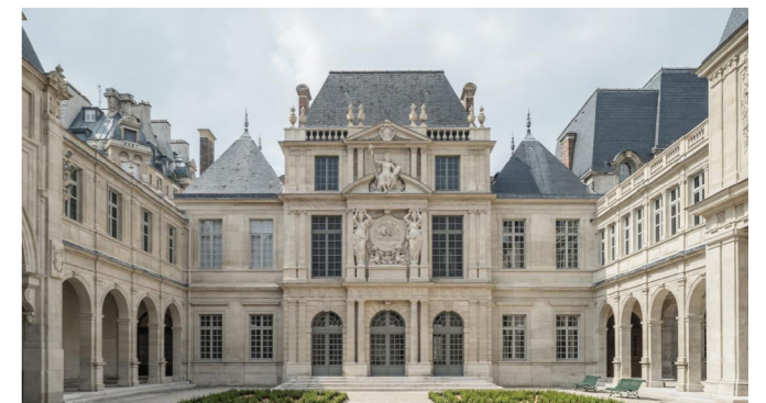
Musée Carnavalet source: https://www.carnavalet.paris.fr/ , ©Cyrille Weiner